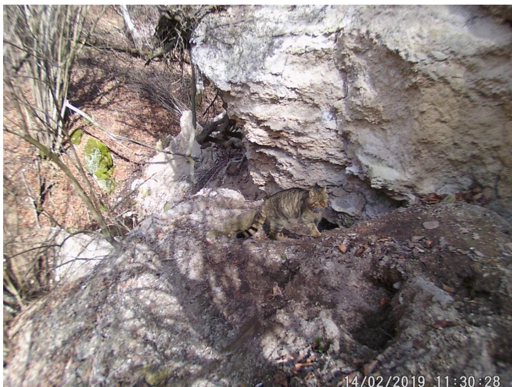
Fig. 9. F. silvestris photographed passing on badger's path in the area of Ljuliak village.

By conversations with local hunters in Hrishteni village we gained some information of observations of “big cats with short tails, possibly lynxes” during the hunting season of 2009 (indications for Lynx lynx (Linnaeus, 1758)). The species was registered in the nearby ridge of Stara Planina Mts (Zlatanova et al. 2009), and its occurrence in Sredna Gora Mts is very possible.