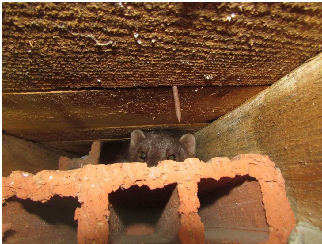
Fig. 8. M. foina under a roof structure of a house at Hrishteni village, searching for birds ( Parus major, Passer domesticus) in the holes of the bricks, 21.01.2020, 10:20 p.m.

Very common species in the area, occupying all types of terrestrial habitats. Numerous in the village areas (Fig. 8), and often met even in the city of Stara Zagora.