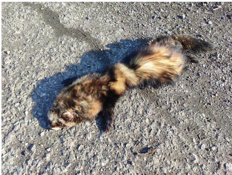
Fig. 6. M. putorius found killed in a road accident east of Liaskovo village in 2021.