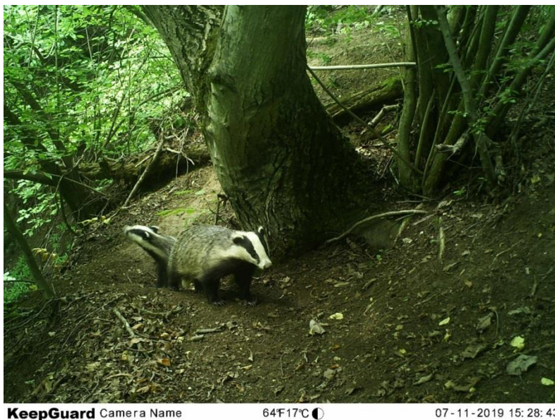
Fig. 3. M. meles photographed in the area of Zmeevo village.

Common and abundant species in the area (Fig.3).