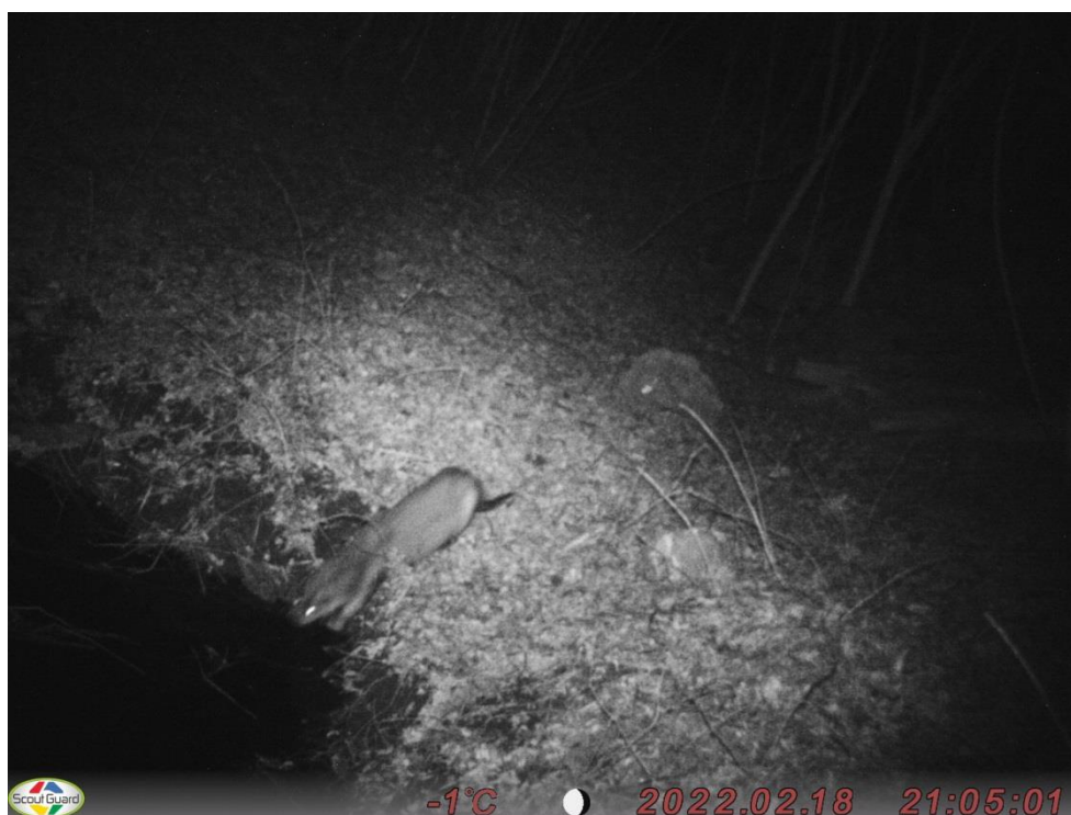
Fig. 4. L. lutra photographed in the area of Chatalka dam.

Common species in the area in the fresh water habitats (Fig. 4).