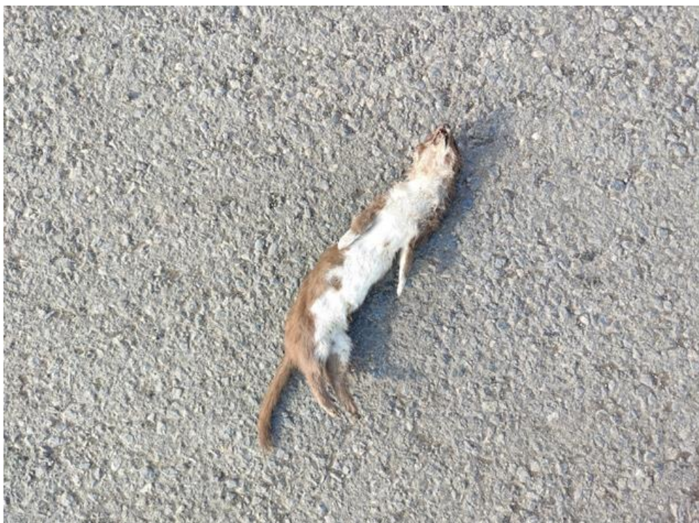
Fig. 5. M. nivalis found killed in a road accident near Trakia university in 2021.

15.06.2021 – one road killed male found west of Trakia university, coordinates: N42 24 02.33 E25 33 54.40, 282 a.s.l. (Fig. 5).