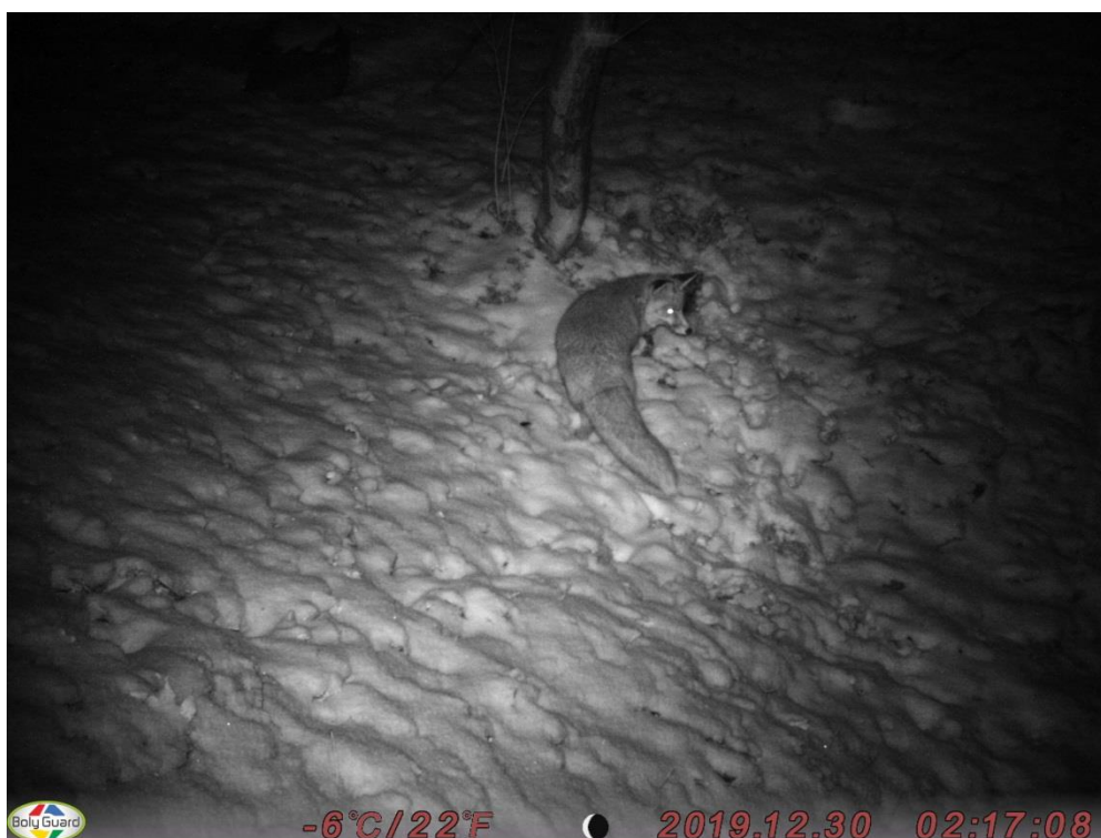
Fig. 2. V. vulpes photographed in the area of Kirilovo village.

Common and abundant species in the area (Fig. 2). Treated in a frame of program for reducing carnivore population density.