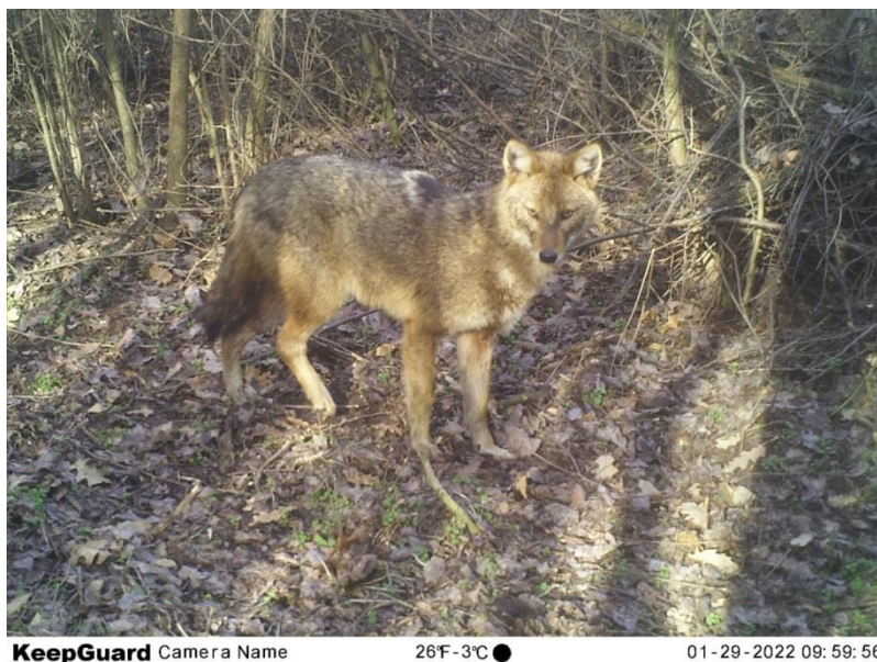
Fig. 1. C. aureus photographed in the area of Kirilovo village.

Common and abundant species in the area (Fig. 1). Treated in a frame of program for reducing carnivore population density.