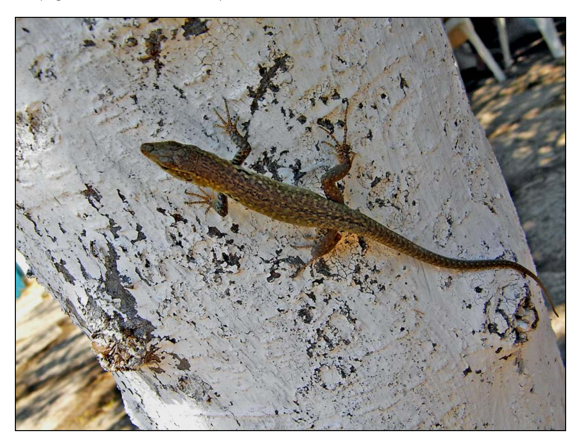
Fig. 2. Photo of the discovered specimen of Podarcis siculus hieroglyphicus .