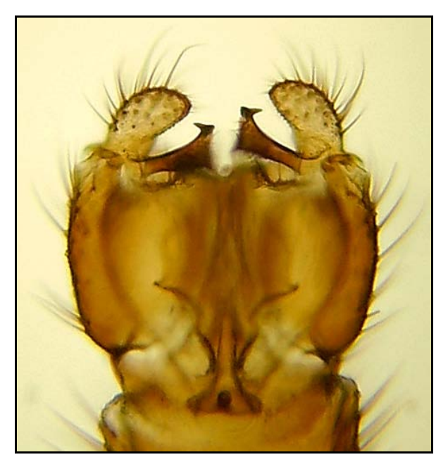
Fig. 1 . Bolitophila japonica – male terminalia, dorsal view, tergite IX is not visible (specimen from Nepal, microphotography).

Bolitophila japonica in Nepal is an indicator for a probable distribution area of this species in the Southeast Palaearctic and northeastern continental parts of the Oriental Region.