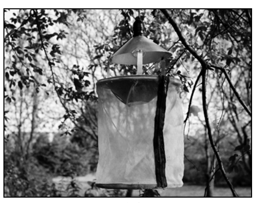
Fig. 1. Light trap.

The materials were collected every 15 days. Insects were captured with exhauster and put in to plastic boxes. The killing of parasitoids was conducted with the means of ethylacetate.